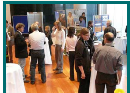
The public part of the Kick Off meeting was a good opportunity for networking.