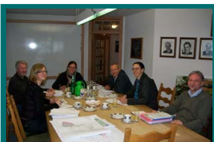
Representatives of the working group at the meeting in Weißbach.